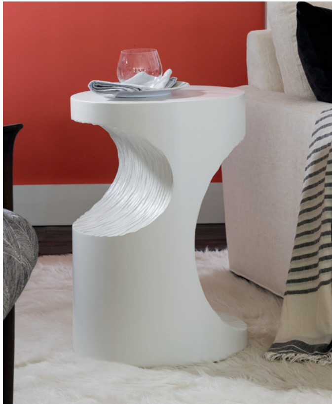
Mar Monte's round spot table is cast in a smooth bright ivory finish and features offset elliptical cutouts revealing organic textures.