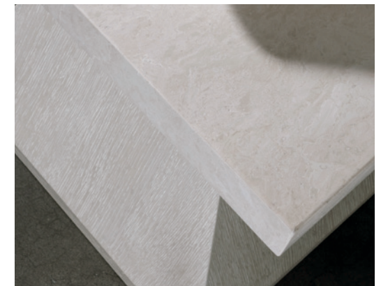
2300-957 Mar Monte Accent Table 23W x 23D x 25H in.