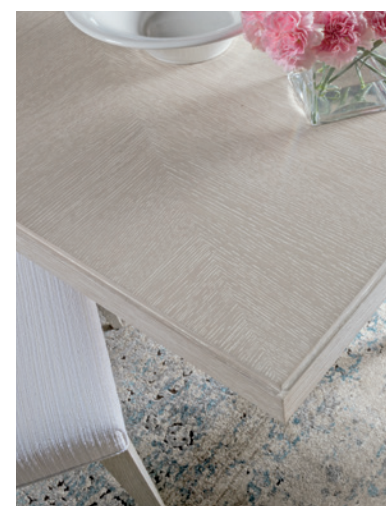
2300-877 Mar Monte Rectangular Dining Table 88W x 48D x 29.5H in. Extends to 128W with two 20-inch leaves