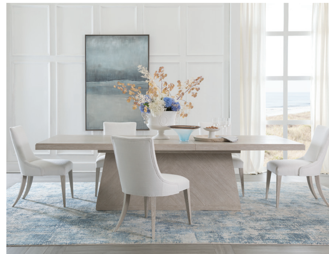
DINING TABLES AND CHAIRS | MEDIA CONSOLES | HALL CHEST | OCCASIONAL TABLES

The soft champagne finish is cerused with an ivory coloration, highlighting the grain. Accents feature leathered Anticato marble tops, bright nickel hardware and metalwork in a warm silver leaf finish. The portfolio includes small and large-scale dining, occasional and media designs with distinctive styling that will transform the look of any room.