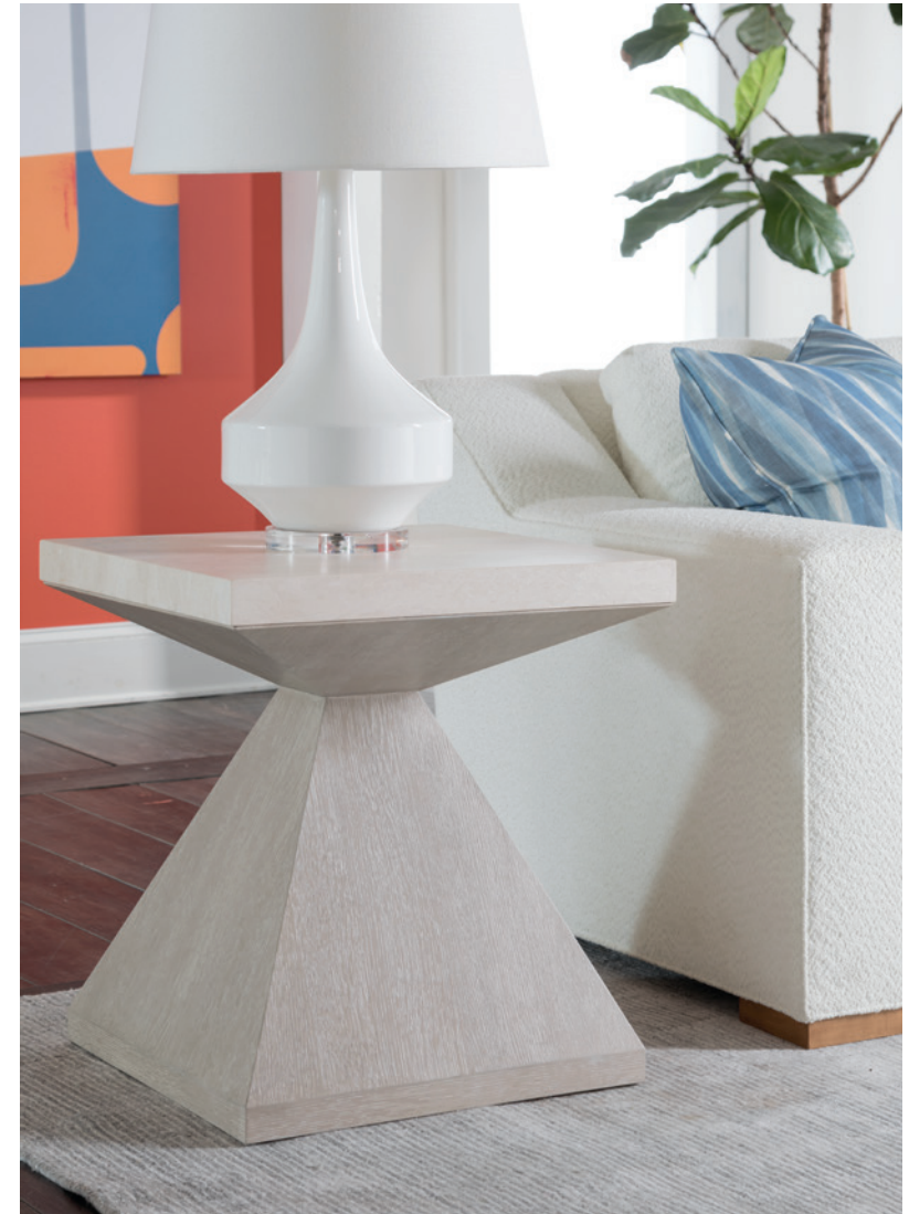
The square end table boasts a dramatic trapezoidal form, with straight vertical white oak quarter grain and topped with a thick slab top of Anticato marble.