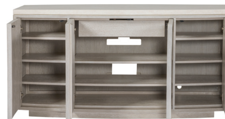
2300-852 Mar Monte Buffet 69.25W x 20.75D x 35H in.