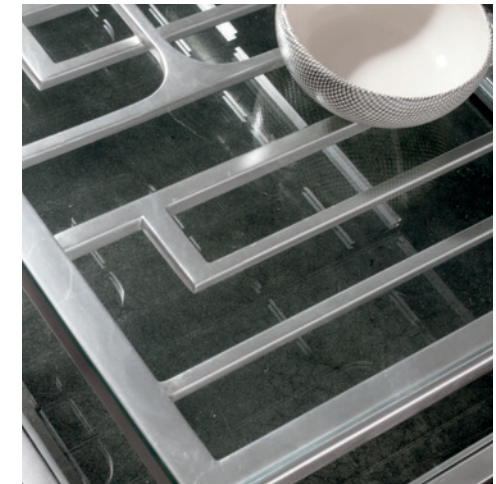
2300-949 Mar Monte Grate Cocktail Table 54W x 32D x 17H in.