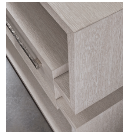
2300-967 Mar Monte Open Console 60W x 14D x 36H in.