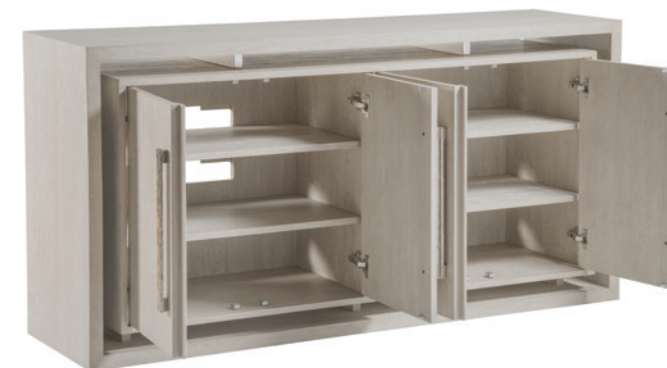
2300-907 Mar Monte Media Console 68.25W x 18D x 34H in.

The 68" media console features four adjustable shelves, two vented back panels, and is intended for 60" class flat panel monitors.