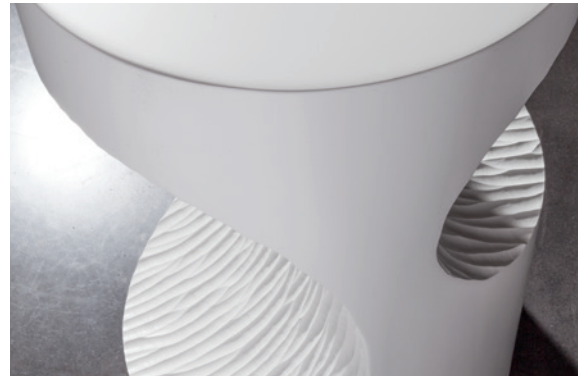
2300-950 Mar Monte Round Spot Table 16 diameter x 24H in.