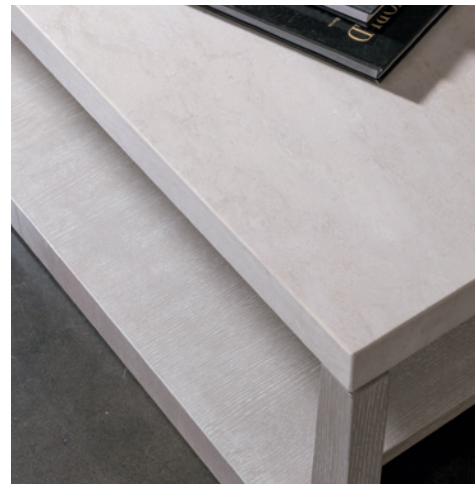
2300-945 Mar Monte Rectangular Cocktail Table 58W x 32D x 19H in.