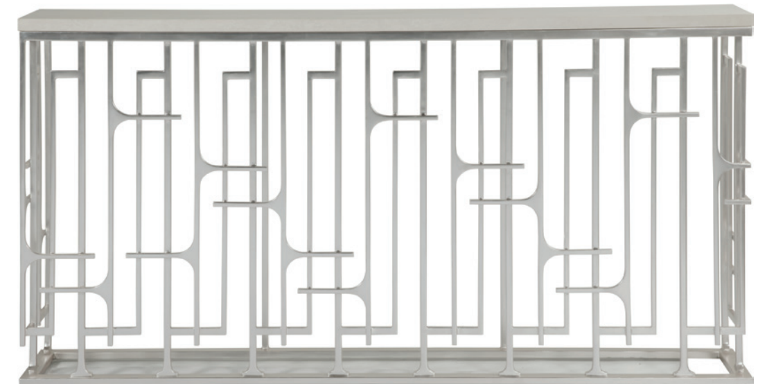
2300-968 Mar Monte Grate Console 71.75W x 12D x 38H in.