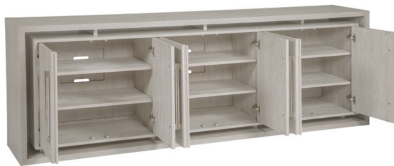
2300-908 Mar Monte Long Media Console 98W x 18D x 34H in.