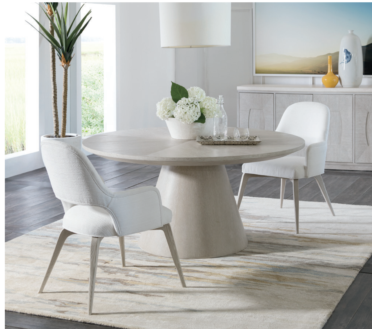
The round dining table features a substantial conical base supporting a round top boasting a book-matched veneer pattern in quartered white oak and a chamfered apron for additional detail. The Mar Monte arm chair is a striking modern form with Mid-Century sensibilities, standing on solid white oak legs in a diagonal orientation and dressed in a performance ribbed chenille that is highly resistant to staining.

2300-877 Mar Monte Rectangular Dining Table 88W x 48D x 29.5H in. Extends to 128W with two 20-inch leaves 2260-880 Lily Upholstered Side Chair with Casters 24.5W x 26.75D x 35.25H in. (Available in Signature Designs Collection) 2300-852 Mar Monte Buffet 69.25W x 20.75D x 35H in.