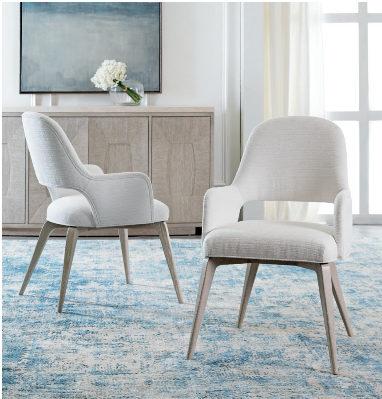
2300-881-01 Mar Monte Arm Chair 22.5W x 27.75D x 36.25H in.

Mar Monte's arm chair is a modern form with Mid-Century sensibilities, standing on solid white oak legs in a diagonal orientation and dressed in a performance ribbed chenille that is highly resistant to staining. Also available in custom fabrics or leathers.