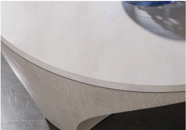
2300-943 Mar Monte Round Cocktail Table 44 diameter x 17.25H in.