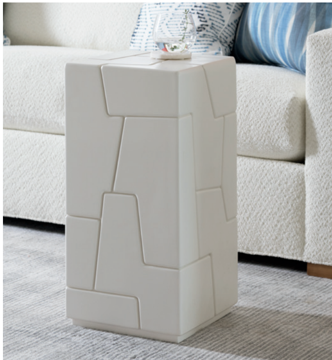
2300-951 Mar Monte Square Spot Table 12W x 12D x 24H in.