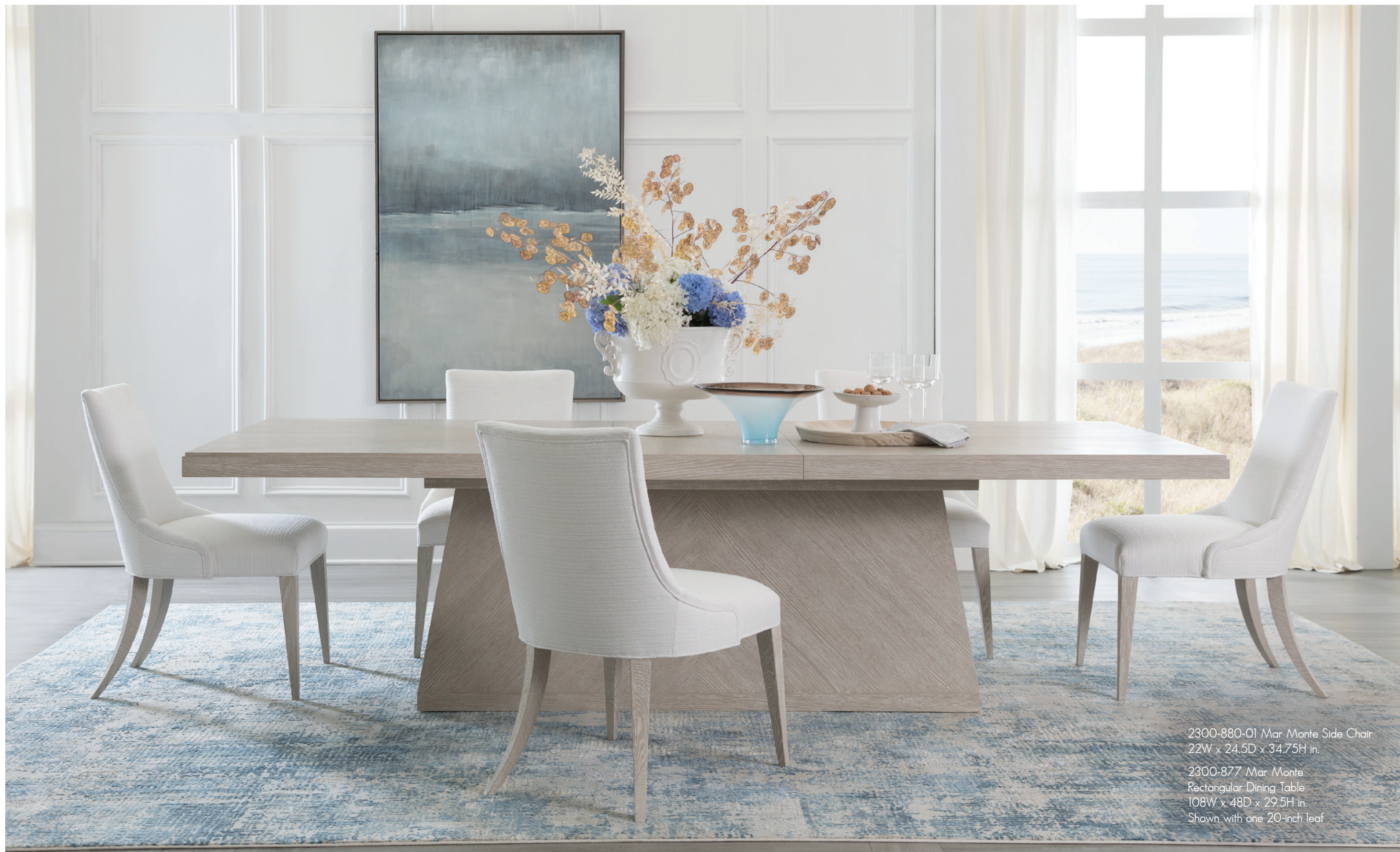
2300-880-01 Mar Monte Side Chair 22W x 24.5D x 34.75H in.