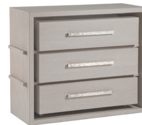
2300-973 Mar Monte Accent Chest 42W x 18D x 36H in.

The hall chest features the same double case construction as the media consoles, allowing the color of the anchor wall to show through, with intersecting parting rails suspending the three drawers. Mitered drawer faces afford a clean fit to the case, while the brilliant nickel of the organic hardware brightly shimmers in a horizontal orientation.