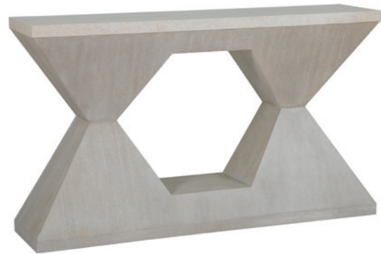
2300-966 Mar Monte Console 65W x 15D x 38H in.