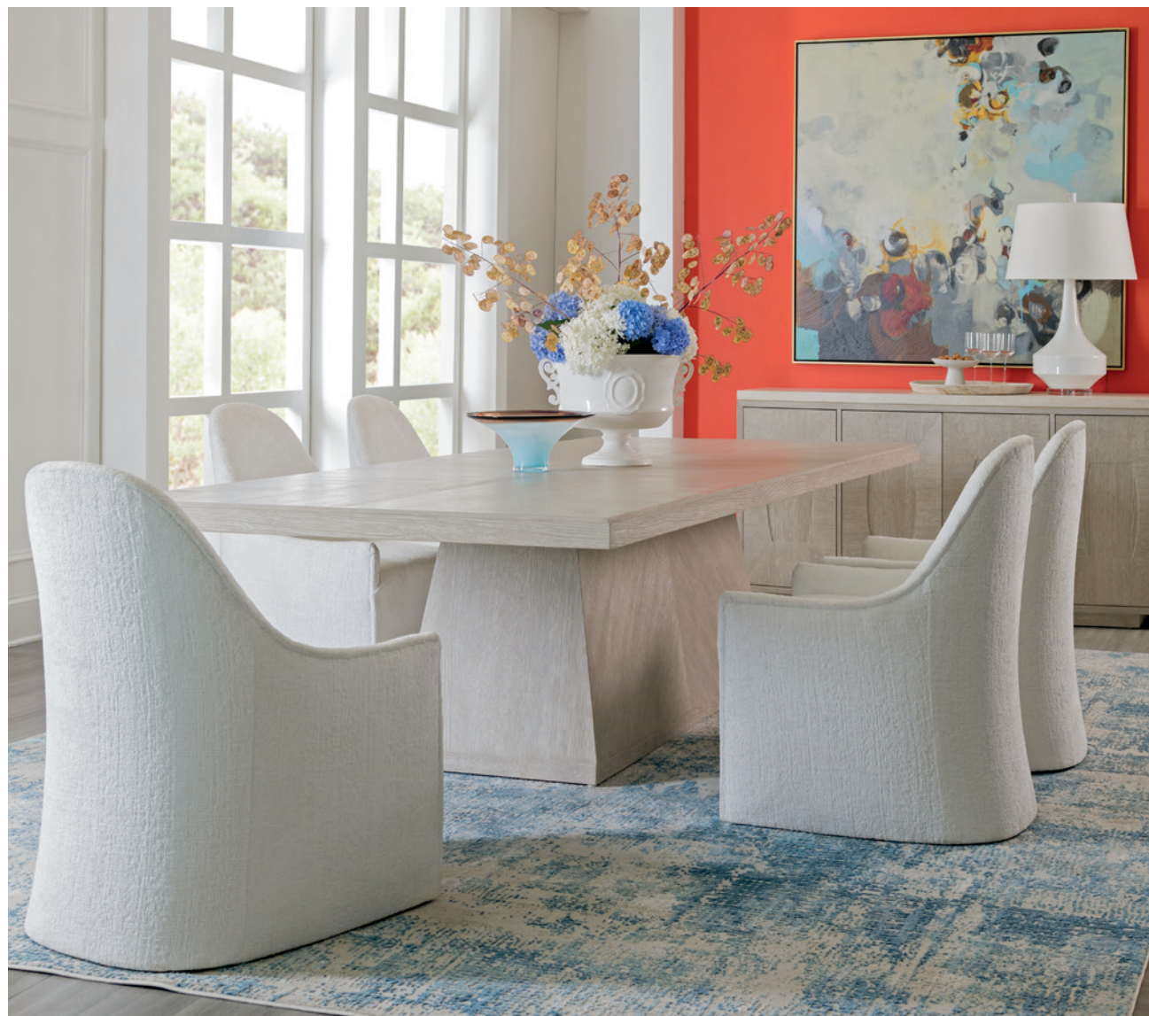
Dramatic architectural lines mean the rectangular dining table is suited to a range of dining chair options, including our shapely Lily side chair with casters, shown here in a chenille performance fabric. Please see artisticahome.com or our Signature Designs catalog for details.

2300-877 Mar Monte Rectangular Dining Table 88W x 48D x 29.5H in. Extends to 128W with two 20-inch leaves 2260-880 Lily Upholstered Side Chair with Casters 24.5W x 26.75D x 35.25H in. (Available in Signature Designs Collection) 2300-852 Mar Monte Buffet 69.25W x 20.75D x 35H in.