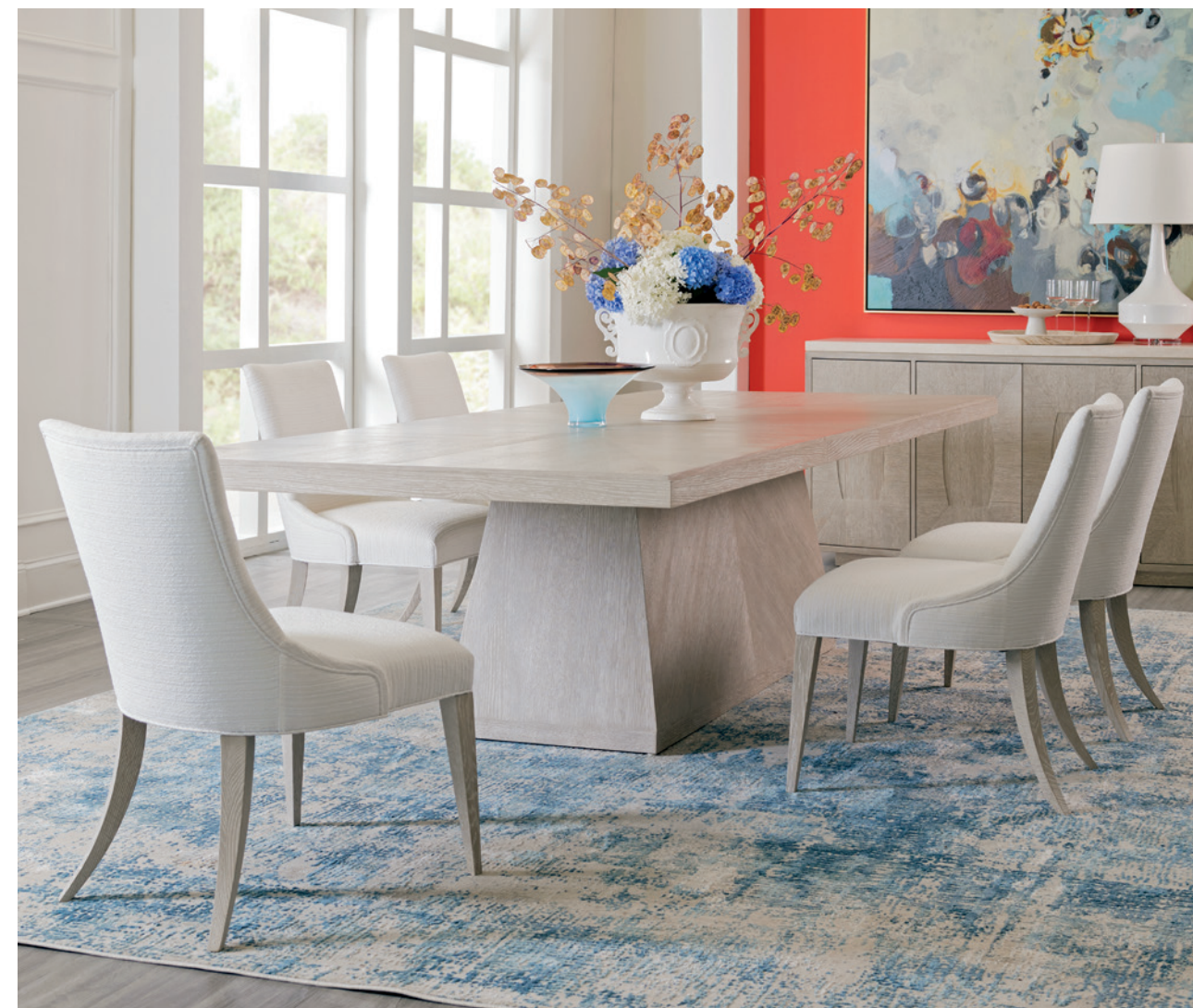
Mar Monte's rectangular dining table features a thick slab top and will seat up to ten with both 20-inch leaves installed, while the dining chairs boast sleek, transitional styling with solid white oak legs and a performance ribbed chenille that is highly resistant to staining.