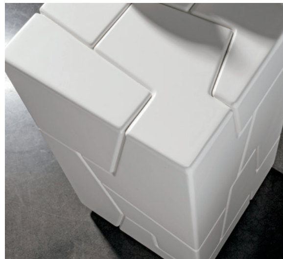
The cast square spot table is a figurative puzzle, with sculpted asymmetrical geometric forms fitting perfectly together and finished in smooth, bright ivory.