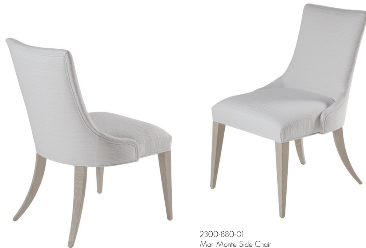
2300-880-01 Mar Monte Side Chair 22W x 24.5D x 34.75H in.

The transitional side chair is standard in a ribbed performance chenille that is highly stain resistant, and is standard with solid white oak legs in the Mar Monte finish. Also available in custom fabrics or leathers.